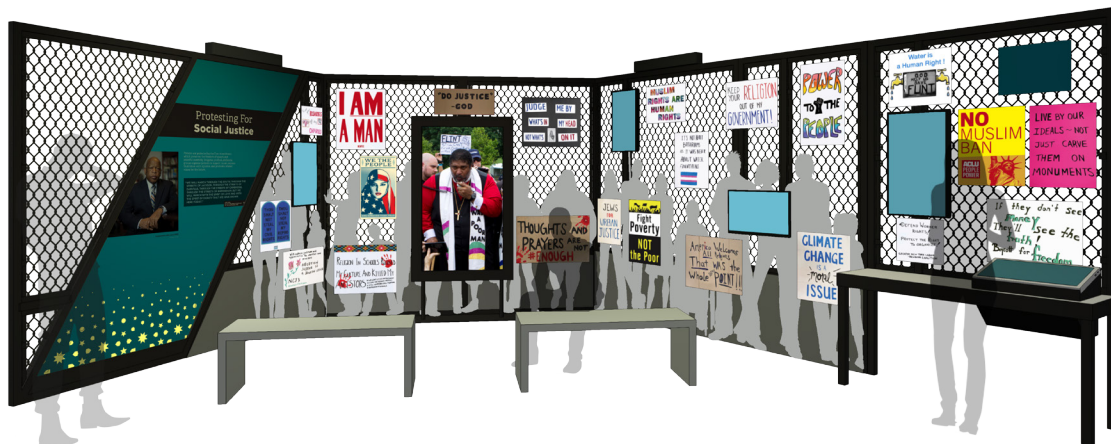
The Power Of Protest Place yourself amongst past and present activists by adding to a digital protest sign collage.