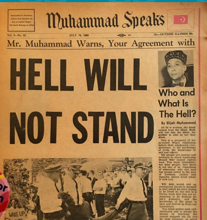
In the late 1960s, Muhammad Speaks was the most widely circulated, Black-operated Islamic newspaper in the U.S., focusing on community journalism and racial uplift.