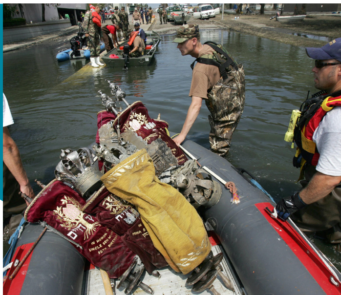
An inflatable boat carrying seven Torah scrolls that were recovered from a synagogue in New Orleans following Hurricane Katrina.

"It is this belief in a power larger than myself and other than myself which allows me to venture into the unknown and even the unknowable."