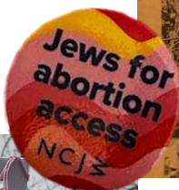
Buttons from the Religious Coalition for Reproductive Choice and the National Council of Jewish Women.